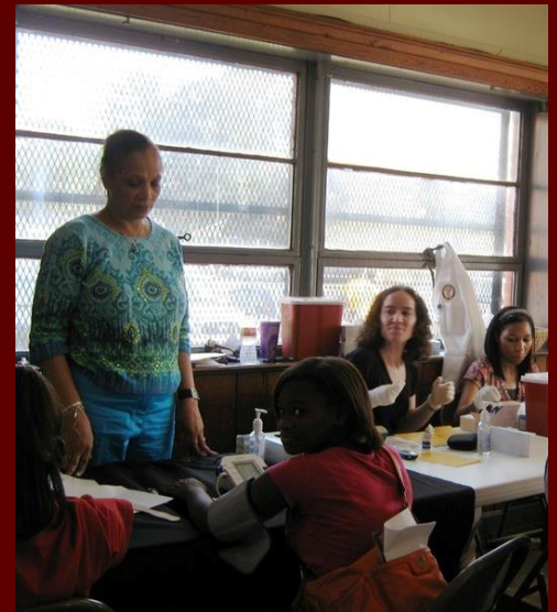
ULM School of Pharmacy serving the Baton Rouge community with service learning.

Numerous state, local and community organizations and businesses participated to make this community event possible. LCHE extends a big "thank you" to our sponsors, partners, vendors, volunteers, and the youth and their parents, the entire community for making this event possible. This event was sponsored by Amerigroup RealSolutions in Healthcare, Peoples Health, and Whole Foods Market. Community partners included BREC, Our Lady of the Lake College, Pennington Biomedical Center, and ULM School of Pharmacy. Additional community patrons include Coca Cola, Capitol City Produce, Flowers Bakery, EMmediaGC, and Hi Nabor Supermarket – Winbourne.